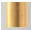
OT Natural brass

for optional accessories/drivers or dimming technology please refer to our pricelist or contact our representatives