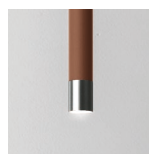
12 rust brown wrinkled final black polished nickel