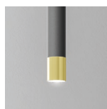
11 anthracite grey wrinkled - final polished gold