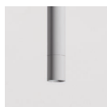
07 wrinkled white RAL 9016