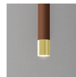
13 rust brown wrinkled final polished gold