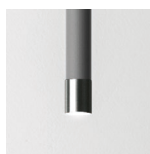
10 anthracite grey wrinkled - final black polished nickel