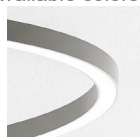
AN Anthracite grey