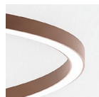
RU Rust brown