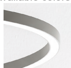
AN Anthracite grey