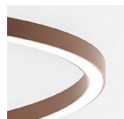
RU Rust brown