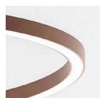
RU Rust brown