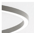
AN Anthracite grey