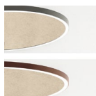
Sound absorbing option upon request