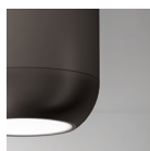
NI Matt nickel

EELc (Energy Efficiency Label compatibility) contain built in LED lamps that cannot be changed: A, A+, A++