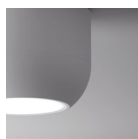
BC Wrinkled white