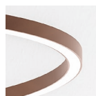
RU Rust brown