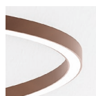
RU Rust brown