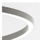
AN Anthracite grey