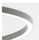
AN Anthracite grey

-sound absorbing option upon request- for more information see www.axolight.eu/u-light/u-light-sound-absorbing.pdf