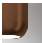
BR Matt bronze